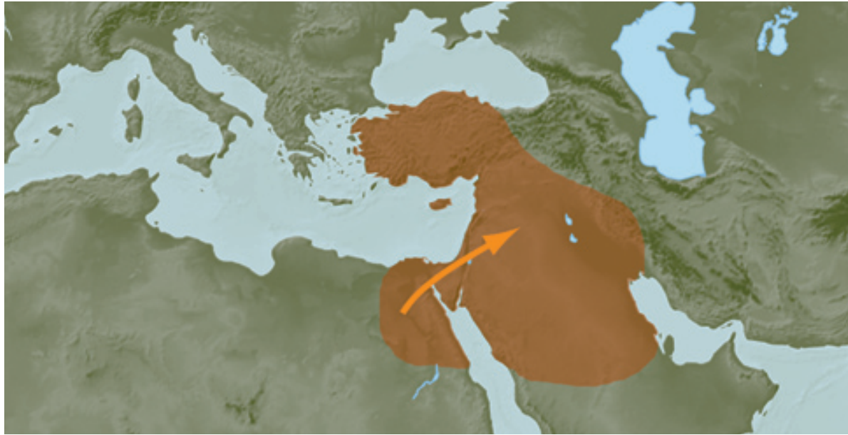
Your ancient ancestors likely traveled this path—settling for various periods of time at points along the way.

the Fertile Crescent, where you'll find present day Egypt, Saudi Arabia, Syria and Iraq.